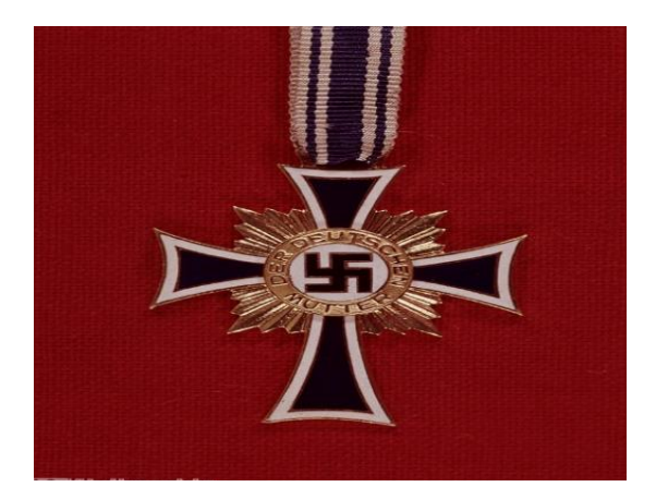
Figure 6. Gold Cross of Honor for the German Mother. Awarded by the Nazi Regime, 1939, (germanhistorydocs.org).

officials. In 1939, around 3 million women qualified for the honor by having four or more children. The Cross of Honor was divided into three tiers to incentivize bearing more children: level three (bronze medal) was awarded to women with four or five children, level two (silver medal) was awarded for six or seven children, and level one (gold medal) was awarded for eight or more children.<sup>35</sup> This award for the German mother was further proof that women were only necessary in their role for reproduction, and as such, they were to be subservient to masculine ideals.