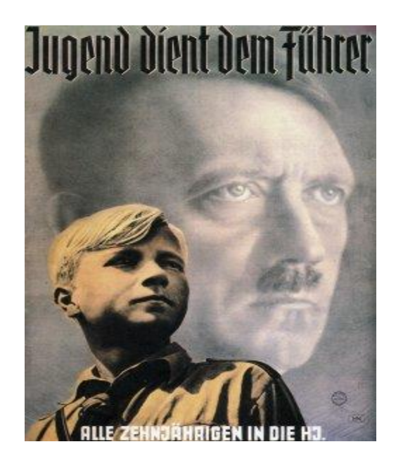
Figure 3. Unknown artist, "Youth Serves the Leader: All 10-Year-Olds into the [Hitler Youth]," 1939.

Because the boys were in the organization to learn masculine Nazi ideals, one of the goals of the Hitler Youth was to make boys in the regime more similar to Hitler. One example of the necessity of youth being more like Hitler can be seen in propaganda posters that recruited the youth. One such poster from 1939 depicts a child in the forefront of the picture looking stoically in the distance, while Hitler is pictured in the background as an overseer of the child (see Fig. 3). The boy seemingly mimics Hitler's posture and facial expression as the poster's captions urges "Youth Serve the Leader: All 10-Year-Olds into the Hitler Youth." Consequently, Hitler Youth found their belonging in traditionally masculine roles of warrior and protector of the regime.